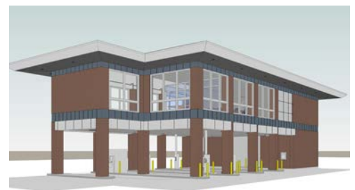
New Building, Back View